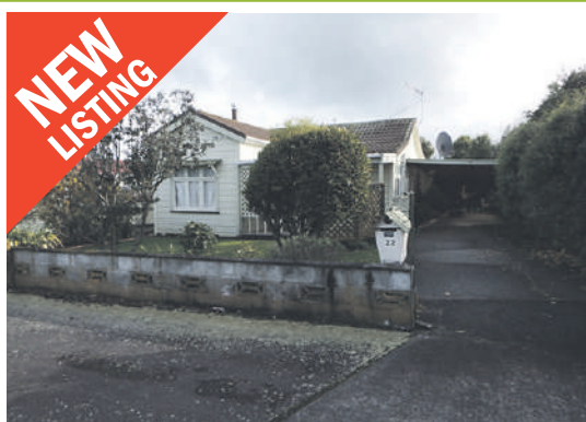
22 Blackwell Street, Marton

Call me - Phillip 027 203 2743 to be SOLD SOLD SOLD