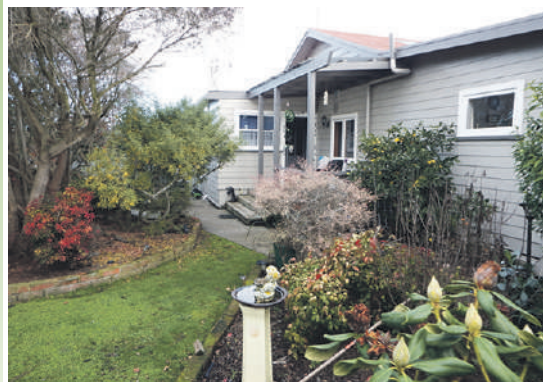
3 Kapuni Street, Marton

Morning coffee on the front terrace, overlooking your private sun drenched garden. Sumptuous meals from your well-appointed kitchen and cosy evenings, in front of the fire, in the large combined lounge and dining room. 3 double bedrooms. Bathroom with bath, toilet & vanity, plus shower in the laundry. Fully fenced compact section, with easy care gardens and carport. Realistically Priced to Sell at $225,000.