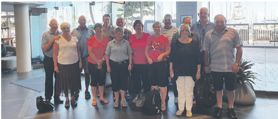
Above: Taihape touring team.