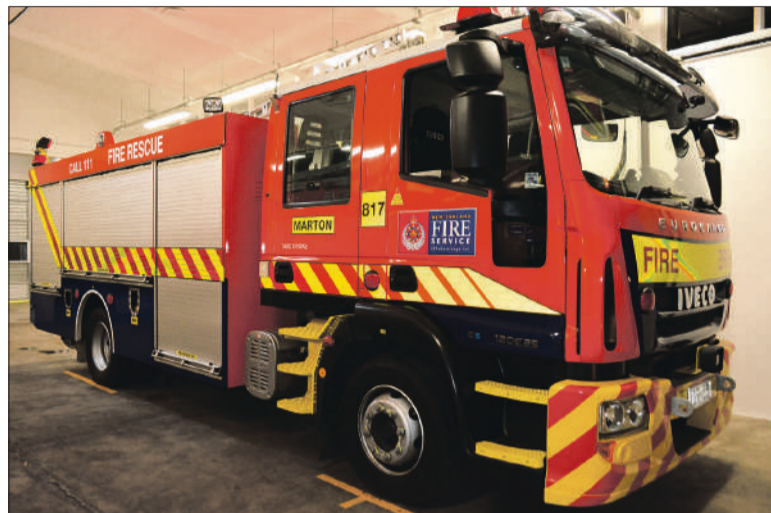
Marton Fire Brigade has a new model Iveco fire appliance with the current FENZ branding.

Marton Fire Brigade has recently taken possession of a newer model of fire appliance from Feilding. The replaced Marton appliance one will go to the Raetihi Brigade.