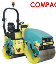
1.52 TONNE DRUM ROLLER