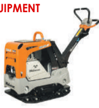
360KG PLATE COMPACTOR

100% Wanganui Owned & Operated www.hiremasterwanganui.co.nz