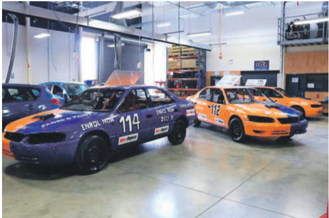
Above: demolition derby cars ready for action in UCOL's automotive workshop.