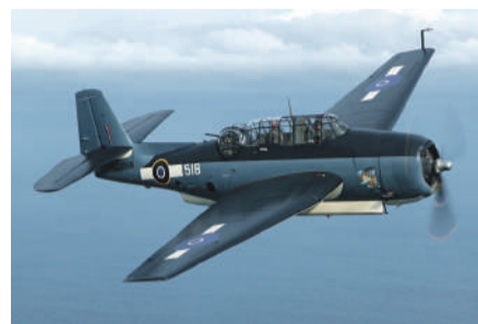
Grumman TBM-3 Avenger - built in July 1945 and served with US Navy; after retirement in 1954 used for 30 years for insecticide spraying.