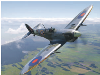
Supermarine Spitfire Mk IX PV270 - built in Sept 1944 and served with RAF in WW2, post war Italian Air Force, Israeli Air Force and Burmese Air Force. Rebuilt to airworthy condition between 2003 and 2009.