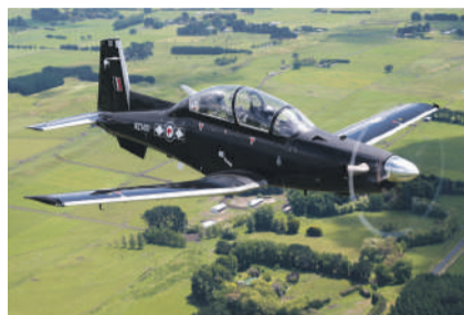
Beechcraft T6C Texan 2 - served with RNZAF since 2014 with Central Flying School and 14 SQN. Used for pilot and instructor training.