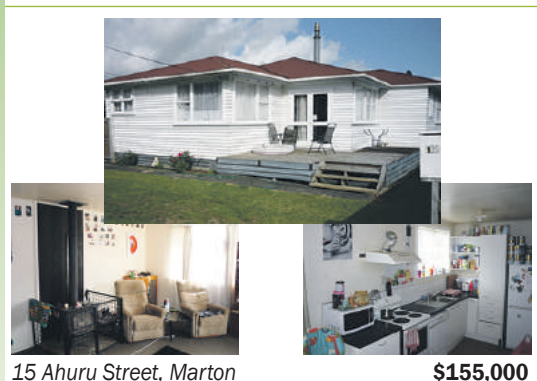
STEP ONTO THE PROPERTY LADDER

This entry level home, or next rental, is realistically priced to sell on today's market at $155,000, with the current tenant prepared to stay on. 3 bedroom weatherboard home, with open plan kitchen, dining and lounge. Bathroom with shower and bath. Separate toilet. Compact, easycare 506m<sup>2</sup> section. The property could be enhanced with redecoration, so has been priced at $155,000 with this in mind.