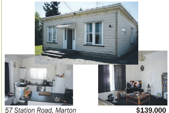
FIRST HOME AFFORDABILITY

Ideal entry level home, or your next rental with potential. 3 bedroom villa, with open plan lounge, kitchen, dining and 2nd living area that opens thru ranchslider to the side vard area. The interior is very tidy in neutral colour and has relatively new floor coverings. The exterior requires painting to your colour scheme. 1,442sqm fenced section, with carport and garage/workshop. Realistically priced to sell at $139,000.