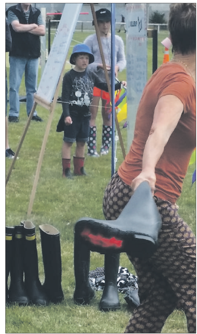
Time to practise throwing gumboots - in preparation for the annual Taihape Gumboot Day in March.

Plans are well underway for Taihape's annual day out. The Taihape Gumboot Day is on Saturday 3 March at Taihape Memorial Park, Kokako St, between 10 am to 4 pm.