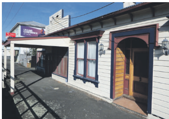
44 State Highway 3, Turakina