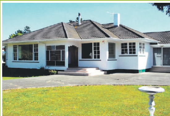
26 Pukepapa Road Marton SPACIOUS WITH 4 BEDROOMS

Call me - Phillip 027 203 2743 to be SOLD SOLD SOLD