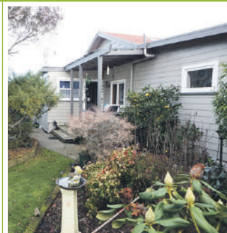
3 Kapuni Street, Marton