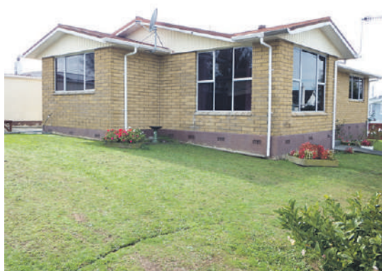
10 Purnell Place, Marton