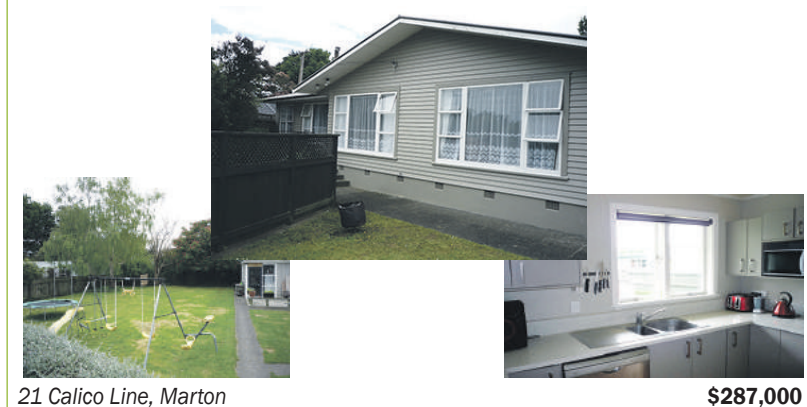
21 Calico Line, Marton

PRIVACY PLUS. That's right, Privacy, plus the advantage of being close to schools and town centre, with this home of 3 bedrooms, plus a 4th small bedroom, or office and a separate sleepout for teenagers, or extended family. Separate lounge. Open plan kitchen and dining room that opens to the large entertaining deck and private, fully fenced backvard. Ideal for a busy family looking for private living. Realistically Priced to Sell at $287,000.