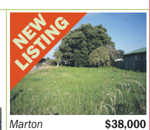
Marton RESIDENTIAL SECTION

This 1,012m<sup>2</sup> section, with services at the road front, will suit a relocated house, or even perhaps a motorhome base. Located on the western side of Racecourse Ave it offers all day sun for your new home. Realistically priced at $38,000.