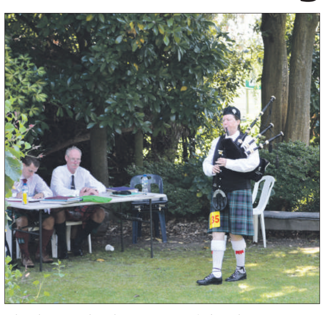
Piobaireachd piper in the shade at 154th Highland games

Tents were the order of the day at the hottest ever Turakina Highland Games on Saturday. Competitors around the two stages for highland dance contests came well prepared with all forms of tent technology.