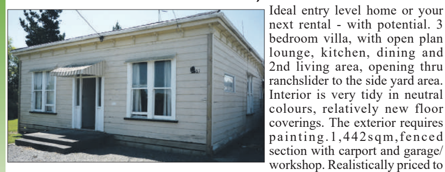
Viewing by Appointment Only - for further details contact