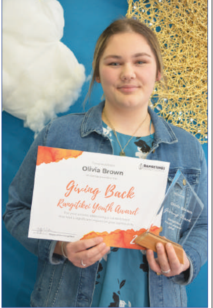
services through her NCEA at FHS.