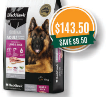
Black Hawk Dog Adult Lamb and Rice 20kg Earn 9 Choices Rewards Points | 206246