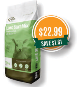
Lamb Startmix 20kg Earn 1 Choices Rewards Point | 213989