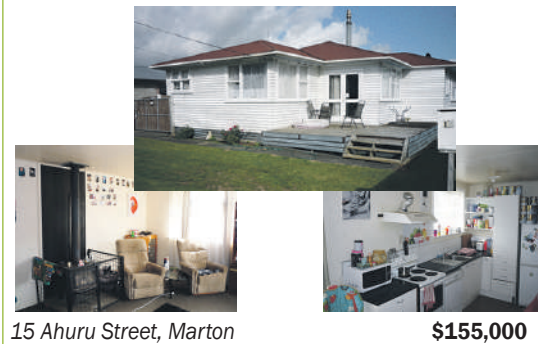
15 Ahuru Street, Marton STEP ONTO THE PROPERTY LADDER

This entry level home, or next rental, is realistically priced to sell on today's market at $155,000, with the current tenant prepared to stay on. 3 bedroom weatherboard home, with open plan kitchen, dining and lounge. Bathroom with shower and bath. Separate toilet. Compact, easycare 506m² section. The property could be enhanced with redecoration - so has been priced at $155,000 with this in mind.