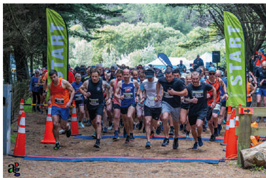
Above: male contestants underway in Saturday's Forest & Beach half marathon.