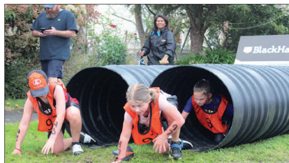
The Children's Shemozzle race features plenty of obstacles to sort out the fittest.

Read details about this weekend's event in the following centre spread.