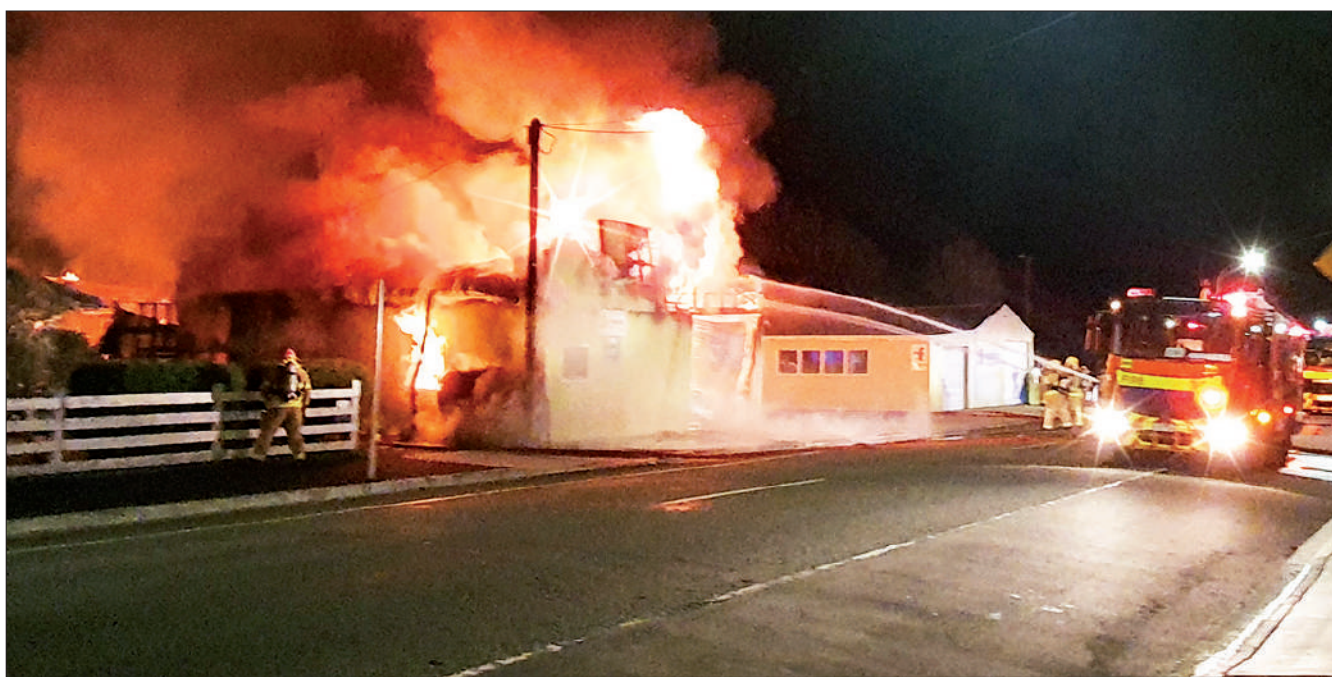
Fighting the major blaze at Marton Panel and Paint.

Marton crews later responded to a small flare-up at the site, which they said was perfectly normal for an incident of its kind.