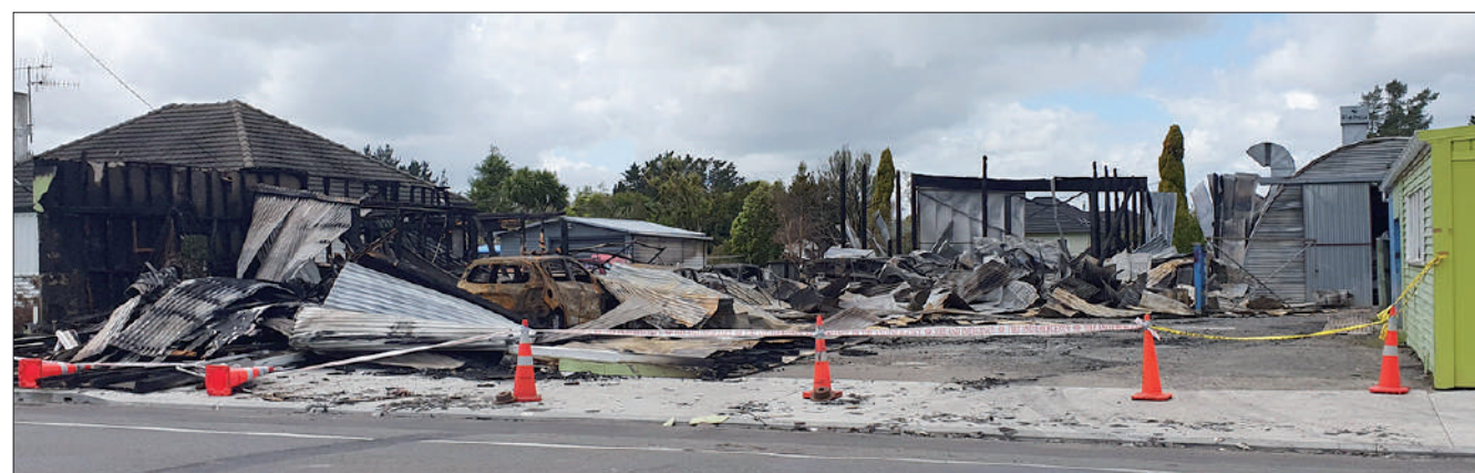
The aftermath, with the remains of cars, showing how close disaster stalked neighbouring homes.