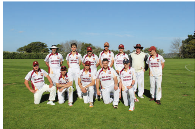
Above: Matt Burke Engineering Marton Saracens beat Wanganui Renegades to take 3rd place in the champion of champions tournament at Labour Weekend.

Email your Sport and Club Reports to us by 10am Tuesday; monitoradvertising@xtra.co.nz Up to 200 words