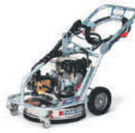
PATH & DRIVEWAY WASHER