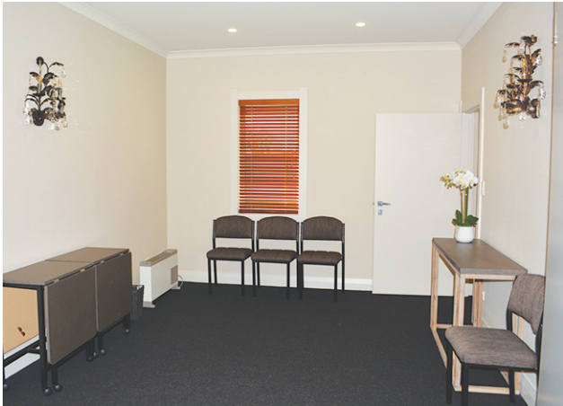
Beauchamp Funeral Home now has two private viewing rooms, comfortably decorated and easy to access.