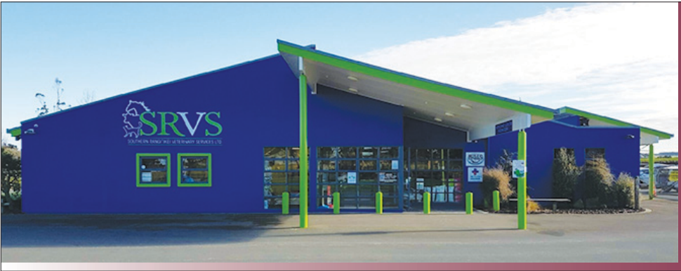
SRVS premises along SH1 in Bulls

Southern Rangitikei Veterinary Services has clinics in both Bulls and Marton, offering a wide range of services. The main clinic, located in Bulls, is built to Best Practice standards, and is a hive of activity all year round. The Marton clinic acts as both a small animal consultation clinic and a retail facility. We currently have a team of 31, comprising of 15 veterinarians, 8 nurses and technicians and 8 support staff. Our companion animal vets are among the most compassionate and caring people you will ever meet, treating your animals as if they were their own. We have modern facilities with state-of-the art equipment to care for your pets. Production farmers will benefit from our personalized approach to animal health. We provide a prompt, efficient emergency care service, and offer tailor-made animal health care programmes suited to individual farms. Whether you farm deer, pigs, goats or alpacas, SRVS offer services for all livestock animals. With dedicated equine vets who have been involved in the equine industry for many years and ride competitively, we can provide a veterinary team that offers you a wealth of experience and knowledge. Our strategy: There is a strong commitment by the team to stand by the four words derived from the SRVS acronym: Service - Respect - Value - Science. Contacts: 233 SH1, Bulls & 48 Tutaenui Rd, Marton, ph 06 3222 333, www.srvs.co.nz