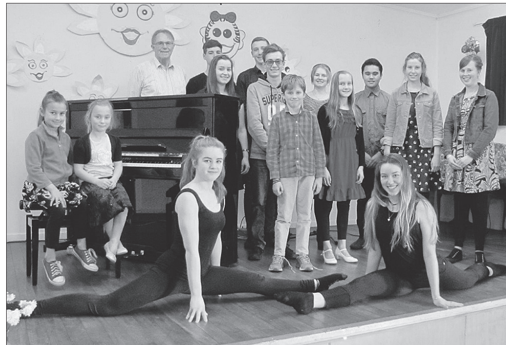
Young music and dance performers in last Sunday’s Marton Music Society concert.