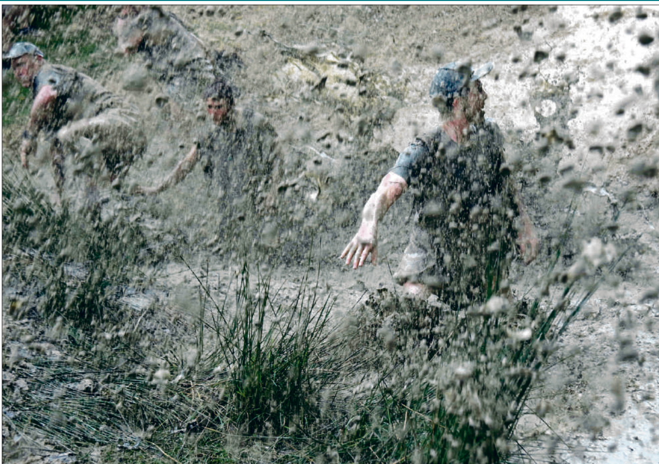
It's a mud storm; as runners in the Shepherds' Shemozzle splash into the swamp at the bottom of the Hunterville hillside; before descending to town. Left: the children's shemozzle faced the same challenge.