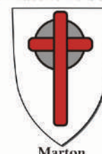
St Matthew's Catholic School