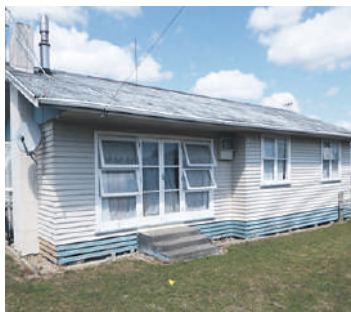
40 Canteen Street, Marton