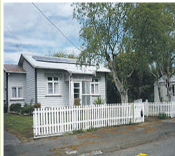
7 Beaven Street, Marton