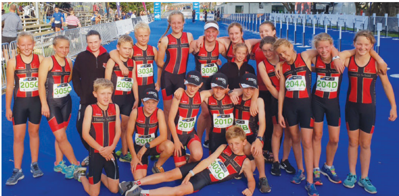
The Huntley School Year 7 to 9 triathlon team is the NZ Secondary Schools' Triathlon Association overall team champion - winning the points competition last weekend in New Plymouth.