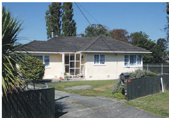
505 Wellington Road, Marton

Are you thinking of your retirement and need a section that is close to town to build your low maintenance dream home? Then this is the ideal site: being a 720m² flat corner section, making it an easy site to build on. Located approximately 200 metres from the centre of town, giving you easy access to shops, churches, and medical centre. Services located in road frontage. Realistically priced at $80,000. Property ID: M1315