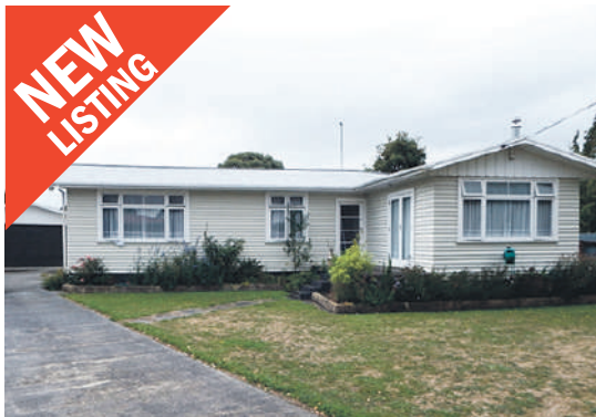
1 Oaklea Avenue, Marton