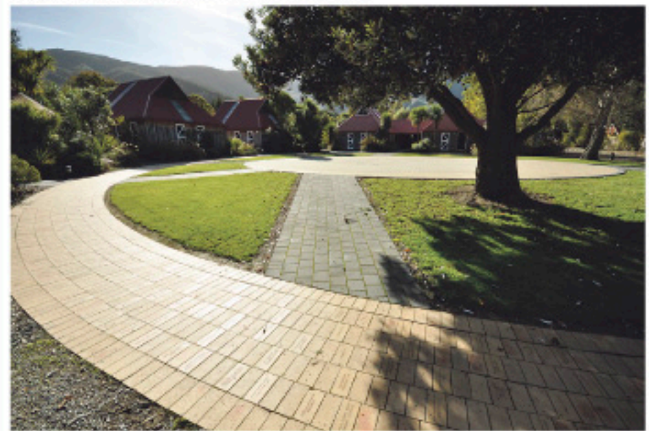
Part of the famed Outdoor Bound campus at Anakiwa.