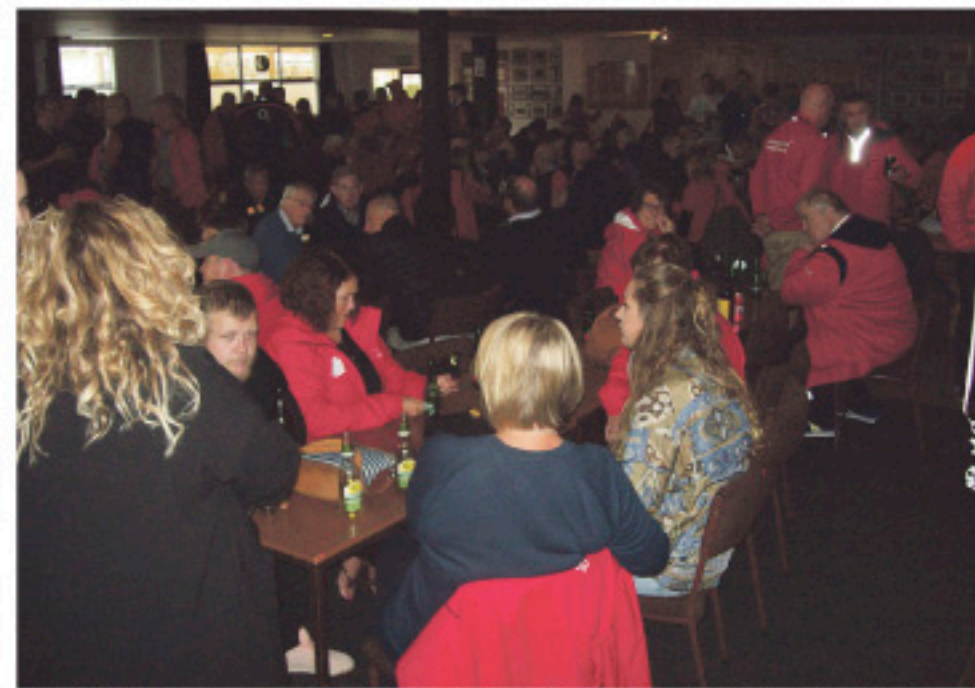
The Taihape Rugby clubrooms were full to overflowing with British Isles rugby supporters.