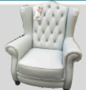
WINGBACK CHAIR $2399 rrp $1679