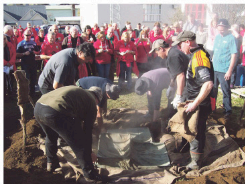
A "sea" of red looked on, as its hangi lunch was pulled from the ground.